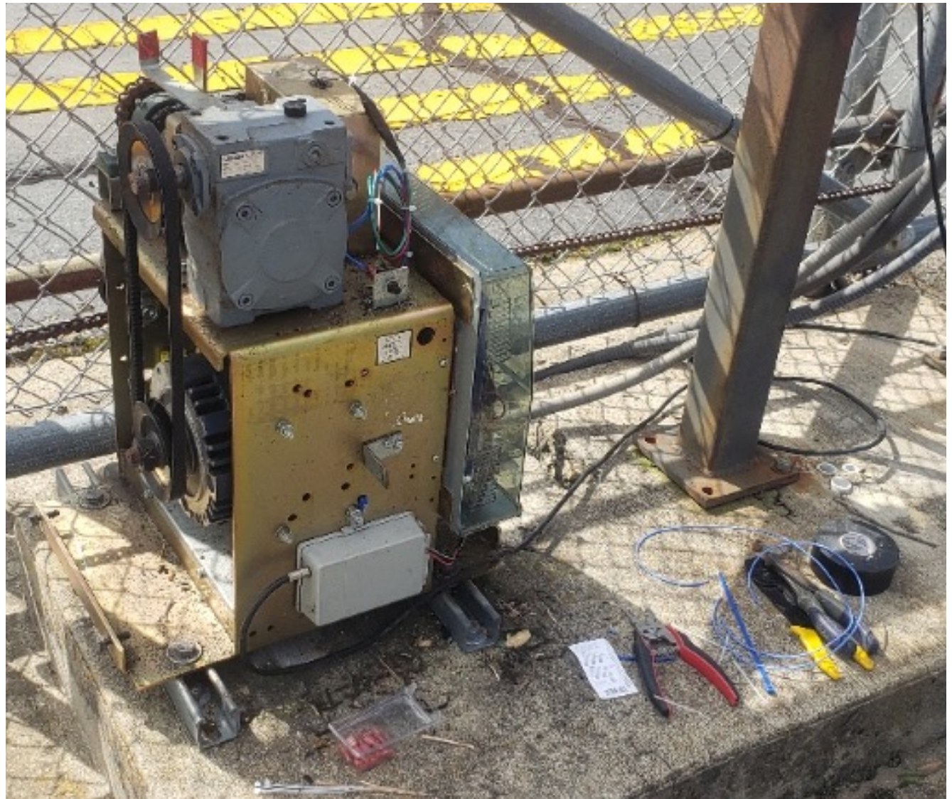
North gate wiring previously repaired Needs rails aligned and cable run